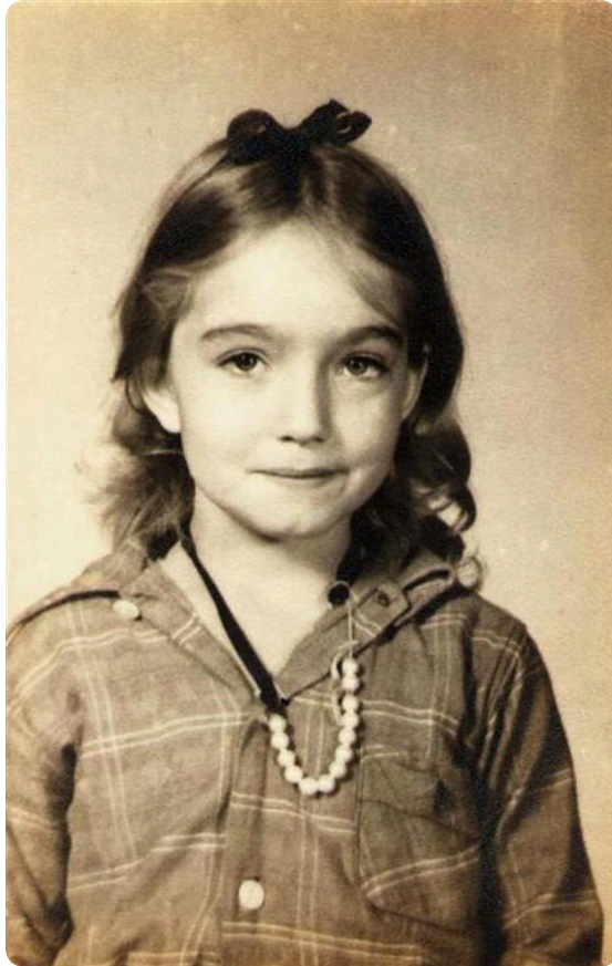
Mom at 8 years old 1948