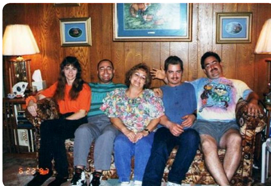
Mom with all her children. Love that smile 1997