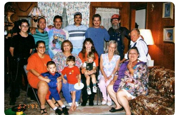
Our Gang 1997